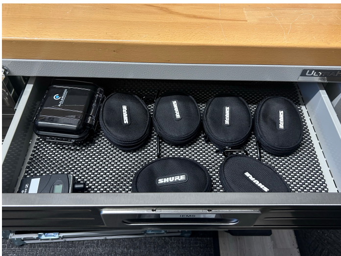
In Ear Monitors Drawer