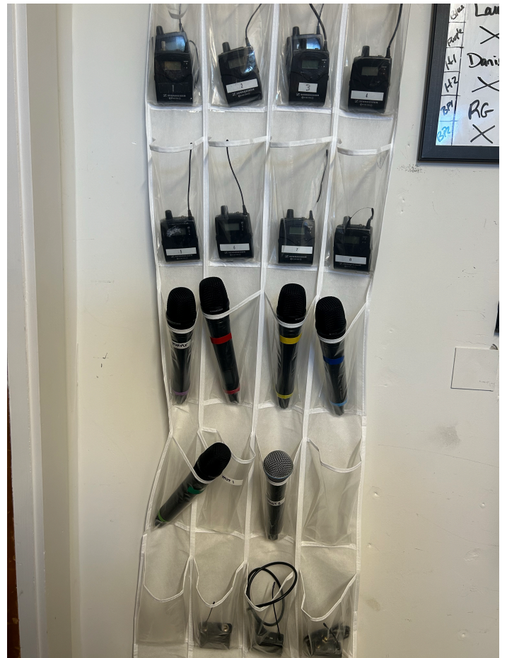
Microphone & Packs